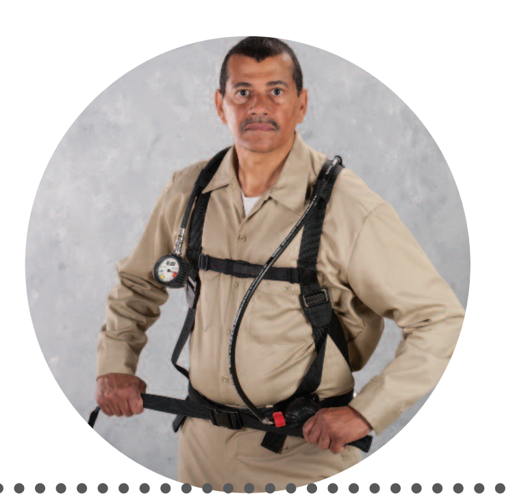
Attach chest strap (if used). Fasten waist strap and pull it tight for a snug fit.