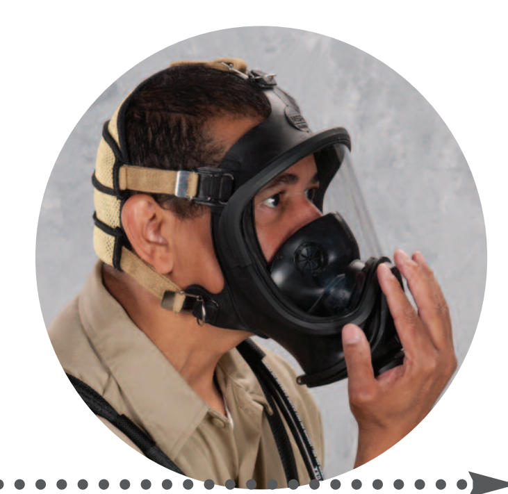
To test exhalation valve , take a deep breath and hold it. Block the inhalation connection with the palm of your hand and exhale. If exhalation valve is stuck, you may feel a heavy rush of air around the facepiece.