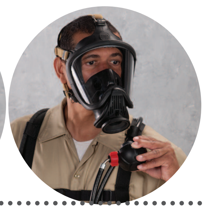
Push the release buttons and pull the regulator down and out of the facepiece adapter.