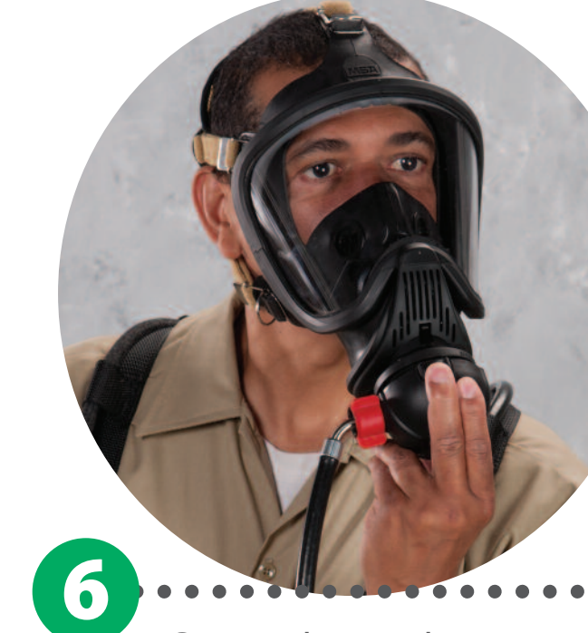
fing the Apparatus Grasp the regulator.