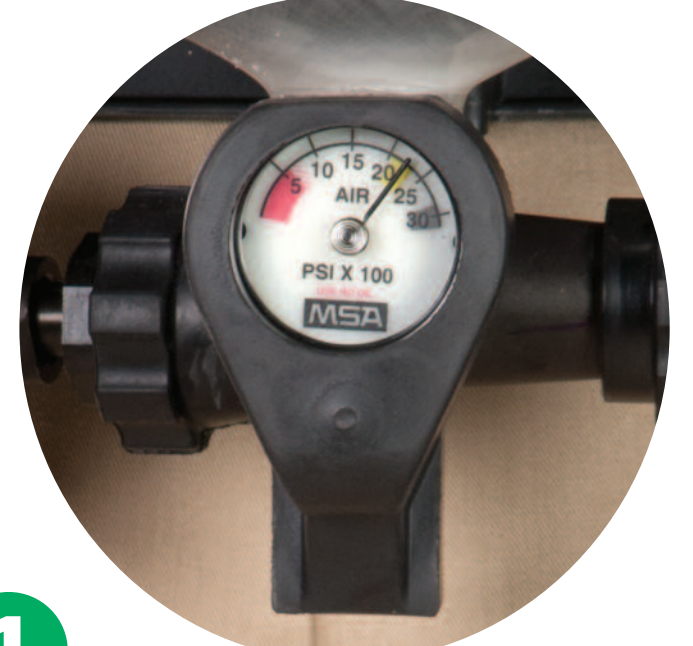
Check that cylinder is fully pressurized. Ensure that the Audi-larm coupling nut is hand tight.