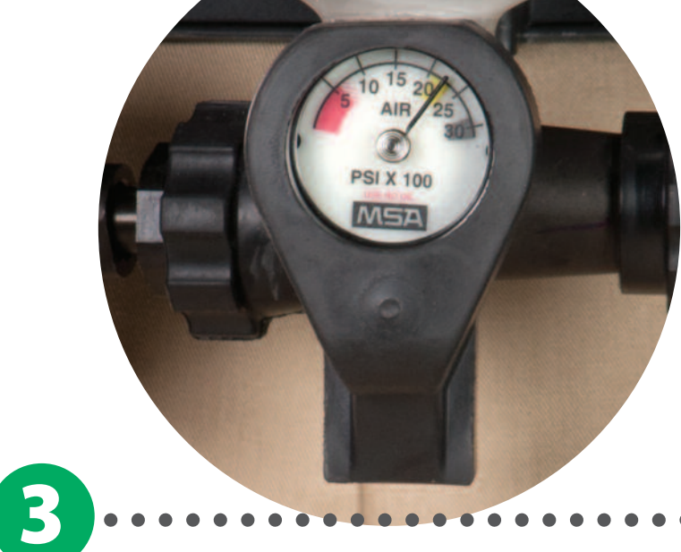
Close cylinder valve and watch pressure gauge . If needle drops more than 100 psig in 10 seconds, there is a leak. Do not use the apparatus until the leak is found and corrected.

Check that no air flows from regulator. If it does, repeat steps 1 and 2. Check pressure and cylinder gauges. Gauges must be within 220 psig for 2216 Air Masks and 450 psig for 4500 Air Masks. Check for bypass operation . Turn red knob counter-clockwise. Listen for air flow, then turn it off.