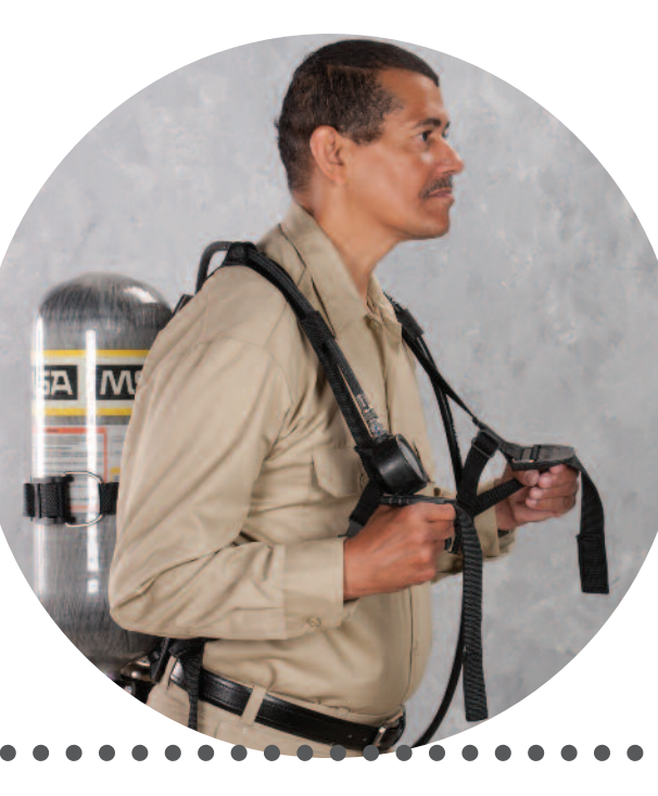
To remove the facepiece, fully loosen the harness straps and pull the facepiece up and away from your face. To remove the carrier harness, press the belt buckle release buttons IN. Disconnect chest strap (if used). To loosen the shoulder straps, grasp the release tabs. Push them out and away from your body. Slip your right arm out of the shoulder strap first, then remove the harness.