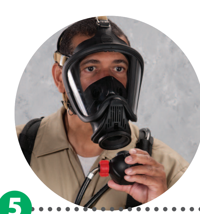
Grasp and orient regulator so that red bypass knob is pointing to the right.