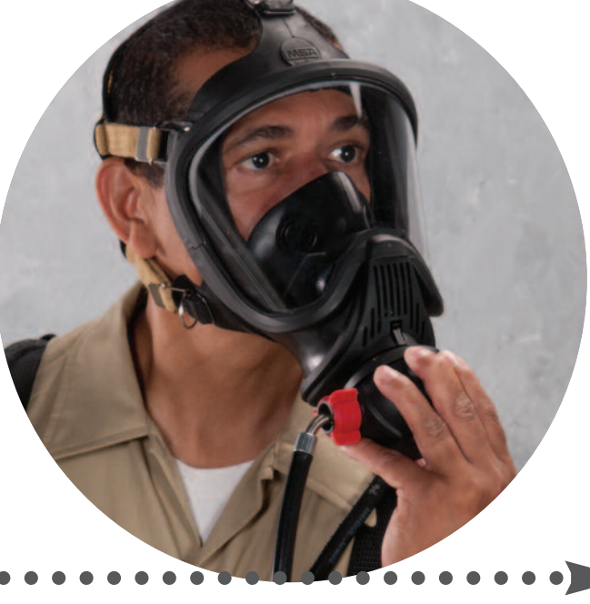
Insert regulator into facepiece adapter by pushing inward. Ensure the regulator locks into the facepiece.

Check proper engagement by pulling on the regulator to ensure regulator is securely engaged to facepiece.