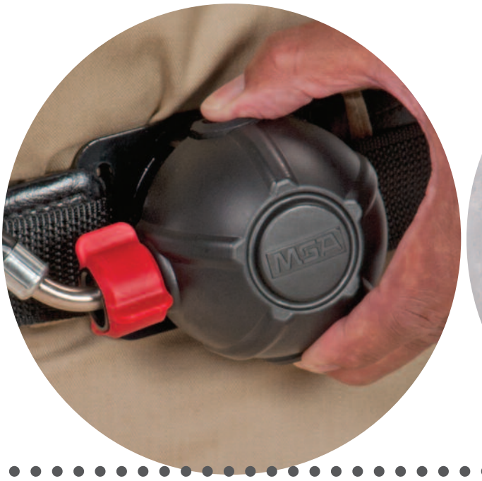
Close cylinder valve fully. Open bypass to release system pressure . Close bypass. Stow regulator with red bypass knob pointing to the right in STAND-BY belt mount.