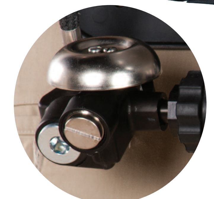
Crack bypass valve slowly to bleed off pressure until gauge needle drops below: 550 psig for 2216 Air Masks or 1125 psig for 4500 Air Masks. The alarm will sound. The alarm must continue to sound until pressure is less than 200 psig. Close bypass fully.