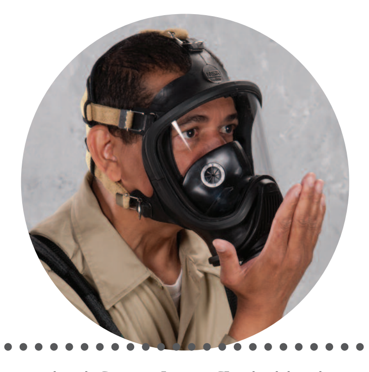
To check facepiece fit , hold palm of your hand over inlet connection and inhale. Hold our breath at least 10 seconds. The facepiece should collapse and stay collapsed against your face. If it does not, readjust facepiece and test again.