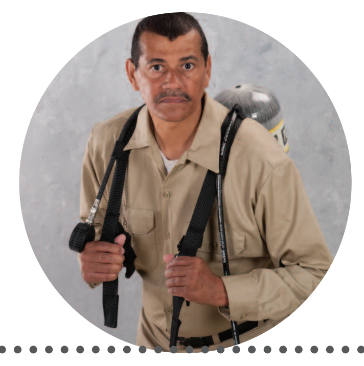
Reach inside right shoulder strap and grasp pressure gauge, slide left arm through left shoulder strap. Bend forward slightly, rest it on your back.