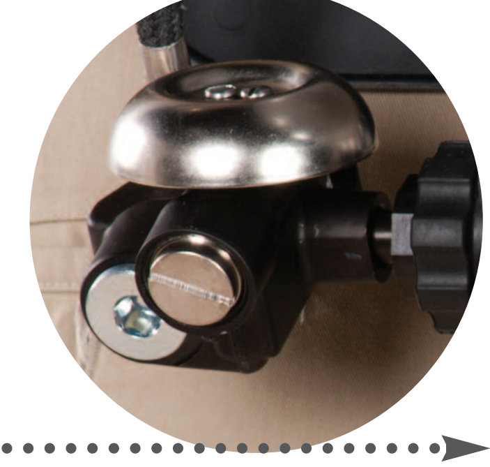
Reach behind and open cylinder valve fully. Listen for the alarm to sound briefly. As the pressure rises, the alarm sounds automatically, indicating the alarm is functional.

Check that no air flows from regulator. If it does, repeat steps 1 and 2. Check pressure and cylinder gauges. Gauges must be within 220 psig for 2216 Air Masks and 450 psig for 4500 Air Masks. Check for bypass operation . Turn red knob counter-clockwise. Listen for air flow, then turn it off.