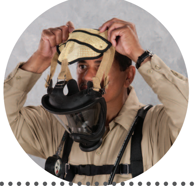
Don facepiece by inserting your chin first. Pull head harness completely over your head and tighten lower (neck) straps.