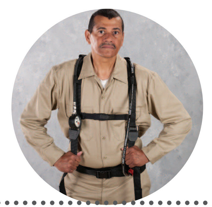
As you straighten up, pull shoulder strap tabs out. Hike unit up for a comfortable fit. Shoulder straps and waist-strap ends must be tucked in and lay flat across the body.